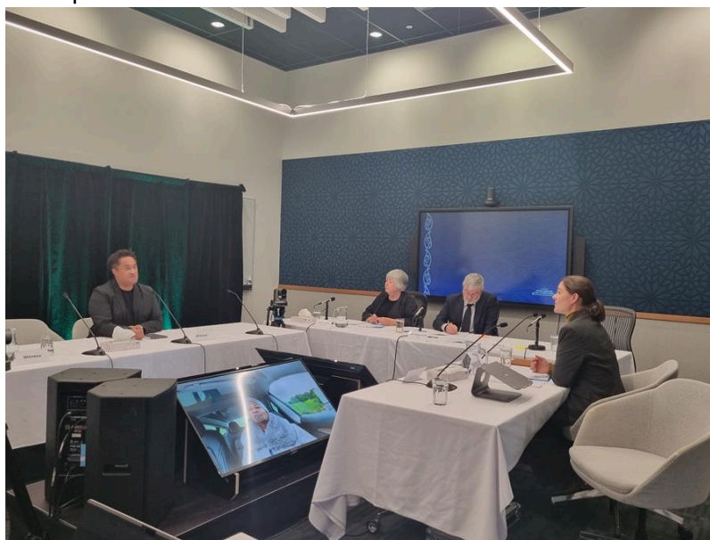
The Commissioners and counsel assisting hear from witnesses at the Pandemic Perspectives hearings

In April 2025, the Inquiry began holding interviews and engagements. Interviews were held with key decision makers and advisers in order to gain insights into the key decisions under review by the Inquiry. Engagements were held with organisations, community groups, businesses, advocacy groups, subject matter experts, and others across Aotearoa New Zealand in order to hear a range of pandemic experiences.